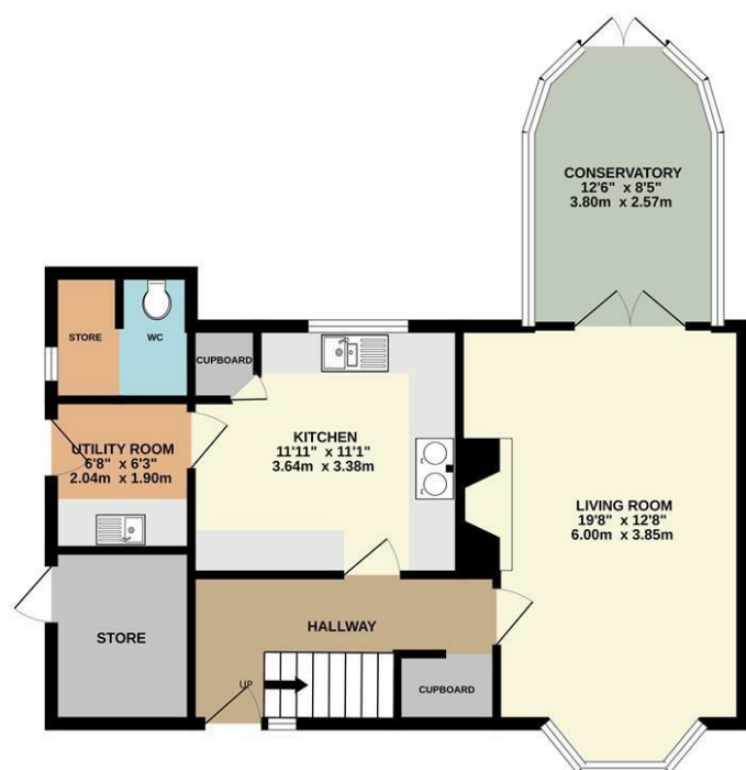
GROUND FLOOR 657 sq.ft. (61.1 sq.m.) approx.